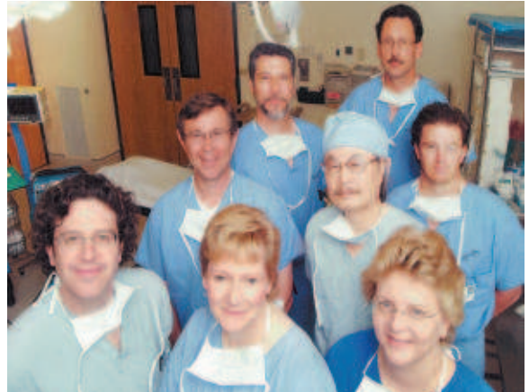
Upland Hills' multispecialty surgeons and surgical team

In addition to the hospital, and attached to it, is a nursing home/rehab center that is essentially a neighborhood in itself. Designed for people to stay